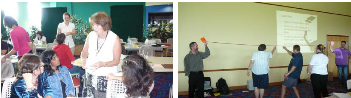
Figure 2. Teachers' participation in the second professional development day.