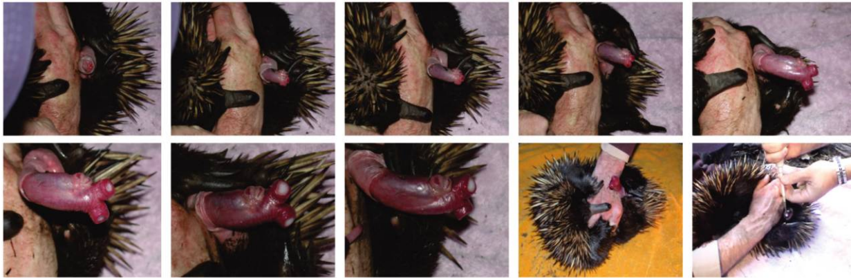
Figure 1: Erection and ejaculation resulting in semen collection in the short-beaked echidna. Note the progressive shutdown of the left side of the glans penis.

the engorged penis would appear to deliver the semen directly adjacent to the female's oviductal ostia. Ejaculation commences approximately 20 s after the penis has become fully erect. When erect, the penis was about one-quarter of the echidna's body length. Erection and ejaculation typically lasted between 10 and 15 min. During ejaculation, the semen pooled into the cups of the rosettes as a white viscous fluid (fig. 2A).