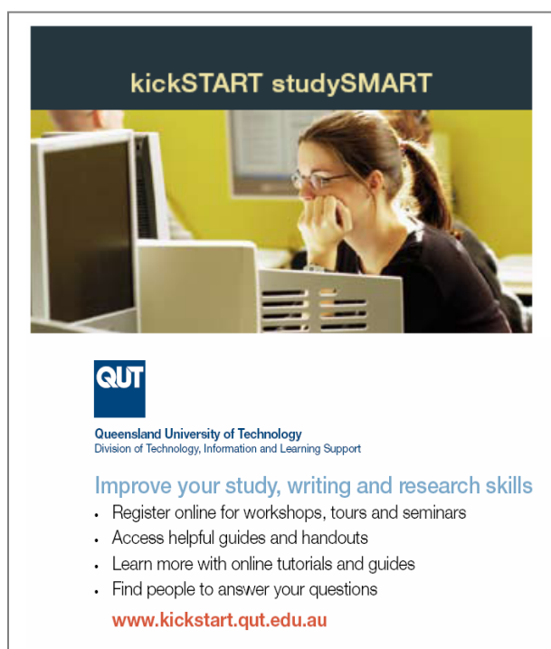
Fig. 2: kickSTART Q Card

Phase 2 of the project has involved consolidating learning tools and resources where a rational connection might be better made for the students. One significant outcome of this process has been the development of a combined learning services portal called kickSTART ( http://www.kickstart.qut.edu.au/ ), and a central 1-stop course registration system ( studySMART ).