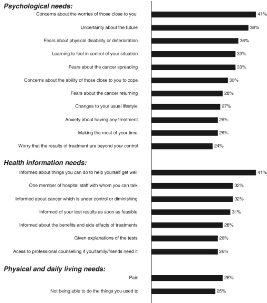
Figure 1. Top 20 unmet needs ranked by percentage patients with moderate or high need.

In terms of services and resource needs, the five most commonly reported unmet needs were: 'easy car parking at the hospital or clinic' (33%); monetary allowance for travel, treatment or equipment expenses' (18%), 'drop in counselling services' (17%), '24 h telephone support and cancer advisory service' (17%) and 'relaxation classes' (16%). See Figure 2.