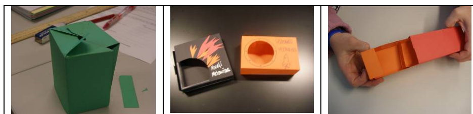
Figure 3 – Examples of containers

Such an approach gave students ideas as was evident in their qualitative responses ( This is an idea I am using on my next practicum ).