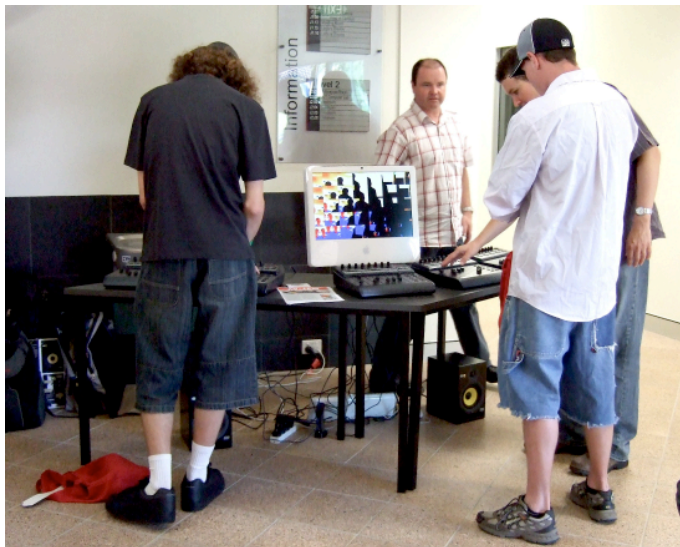
Figure 4: Young people using AV Jam USB controllers.

Indeed whilst much of the jam2jam and AV- jam algorithms have been based upon hip hop, grunge and RnB popular music styles we have also been able to perform a Xenakis chaos algorithm piece (Xenakis 1991) using two laptops and a vector interface that a five-year old could control. What this says for musicology is that the musicological analysis of style becomes the principle architecture for the musical knowledge encountered by the players. In ethno-musicological terms we can observe how particular musical value systems interact with the community of players in multiple modes of engagement. As Dewey suggests art is both in and with experience and with this technology and experience design we can experience both simultaneously (Dewey 1989).