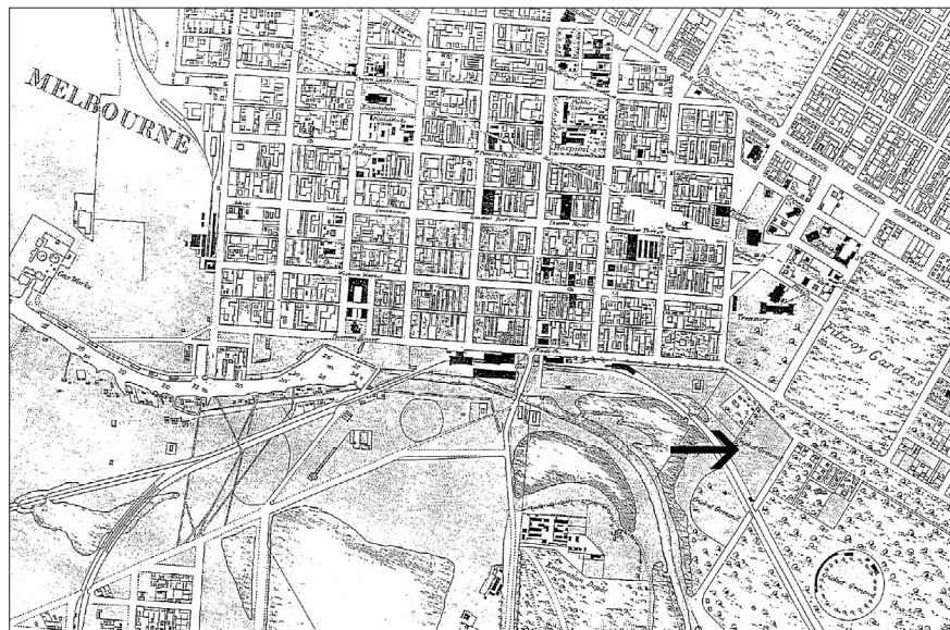
Map of Melbourne, showing the East Melbourne Cricket Ground (arrowed). The Melbourne Cricket Ground is to the right. Hobson Bay and Yarra River surveyed by H. L. Cox, 1866.