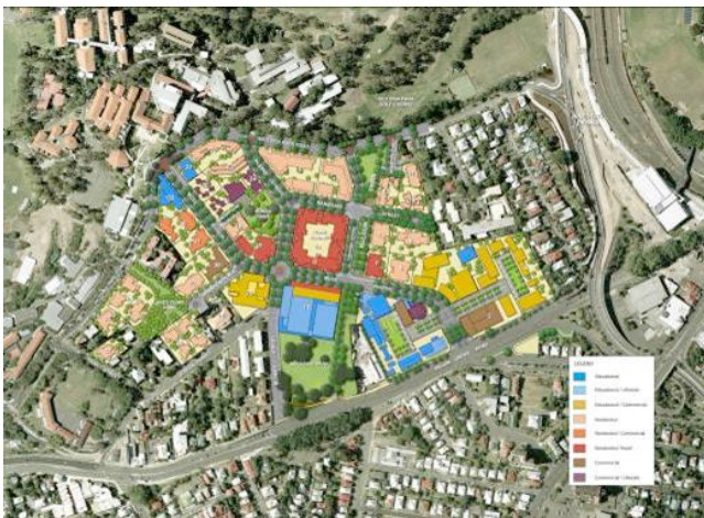
Figure 1. Master plan view of Kelvin Grove Urban Village

Constraints and restrictions can foster participation and engagement. – A limited possibility to upload and submit user-generated content can also lead to a higher participation. As users are forced to create their contribution under certain circumstances (e.g. at a certain place or time), they cannot postpone it or procrastinate. The fact that they only have the chance to do it in situ , might incentivise them and lead to a higher participation. As pointed out before, the anytime, anywhere concept could further lead to less detailed descriptions or even not submitted content, due to the loss of activation.