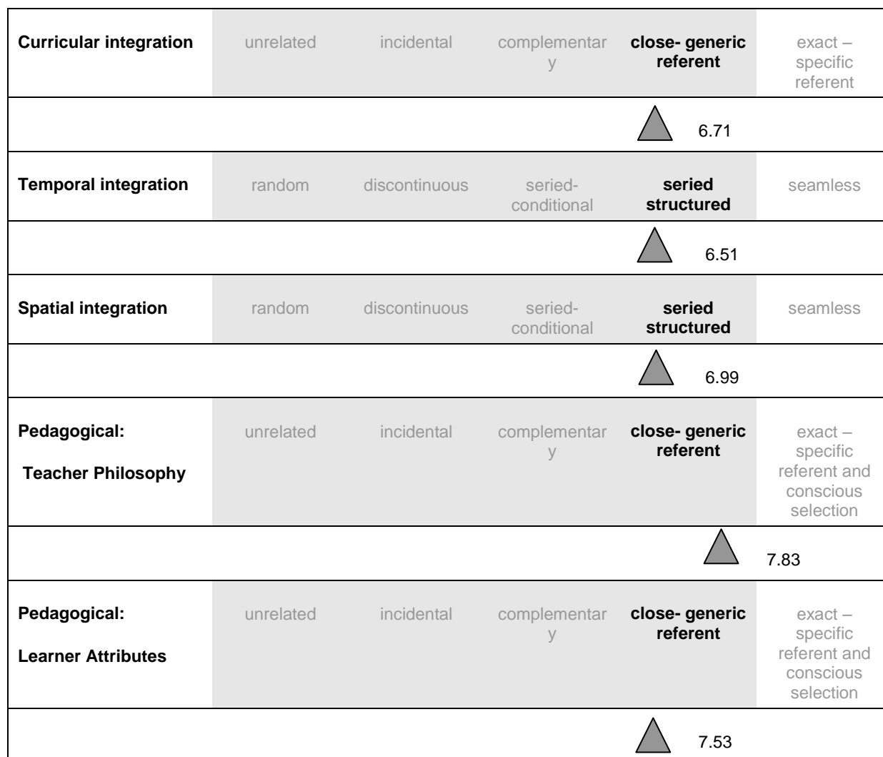
Figure 6: School profile - mapping of task continua

These statistics can also be mapped into a figurative diagram making use of the profiling continua. The mapping for the pilot school in this study is shown in Figure 6.