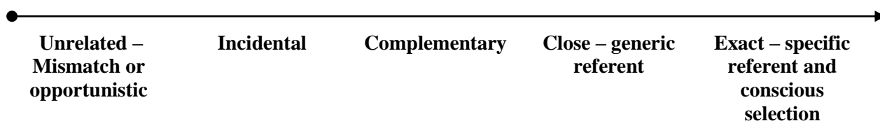
Figure 5: Pedagogical integration continuum (learner attributes)

The second component of pedagogical integration is a measure of learner attributes. In this measure (see Figure 5), there is an increase in degree of articulation of student attributes into outcome and teachers may consciously use software/processes antithetical to philosophy to achieve outcome. This item might also be concerned with adaptive or assistive technologies and accessibility options.