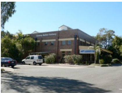
Butter Factory Art Centre