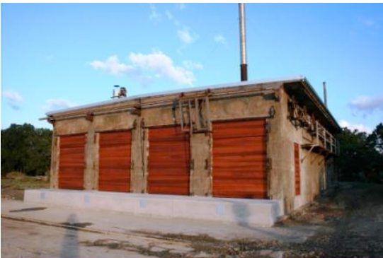
Restoration of old timber mill boiler