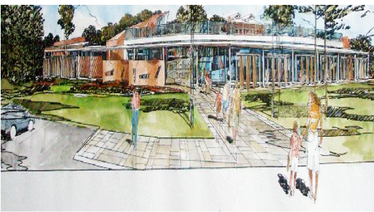
Proposed Library under construction

Masterplan and physical development of Cooroy Lower Mill site