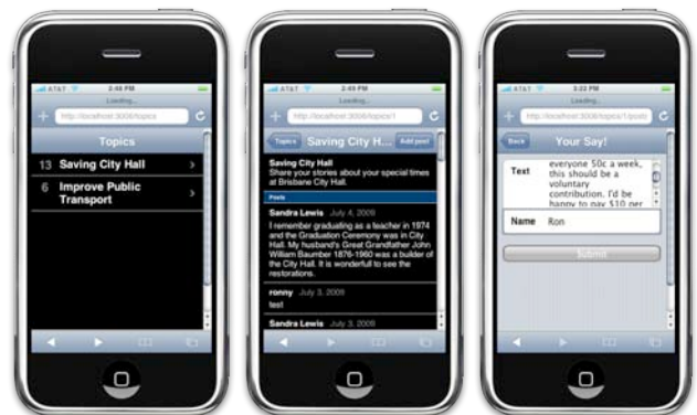
Figure 3: Mobile phone application (tailored for Webkit running on Android and iPhone)

The mobile website acts as an input and output channel. It not only allows users to post new messages to the screen, it also allows them to browse and view the history of previous civic discussions, which might still be ongoing through the web interfaces although not promoted on the public screen anymore (Figure 3).