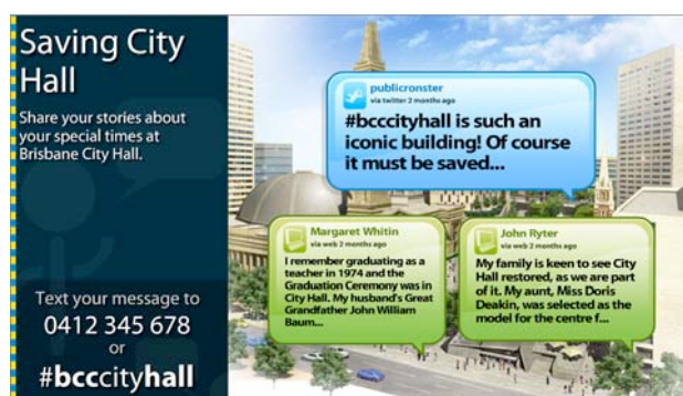
Figure 1. Screenshot of the public screen

The goal of the architecture (Figure ) is to allow councils to advertise civic issues or questions related to a particular place on a situated display within that place, and furthermore provide a wide range of input and output channels in order to lower the hurdle for residents to participate in the public discourse about this topic as much as possible. Input channels refer to the ability to contribute content by posting a comment, output channels refer to the different ways of accessing the content.