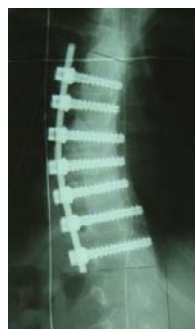
Fig 1. Single rod anterior correction for adolescent idiopathic scoliosis

Contemporary surgical interventions for AIS include both anterior and posterior rod systems, in which a single or double rod construct provides curve correction and stability. The relative merits of different instrumentation systems and approaches are still the subject of rigorous debate [1]. One innovative technique for AIS surgery is single rod anterior correction and fusion using an endoscopic (keyhole) approach. Single rod techniques (such as shown in Fig. 1) have shown good radiographic and clinical outcomes provided adequate patient selection is practised [2], and endoscopic techniques for spinal deformity have been under development since 1993 [3]. Such techniques, while relatively recent, appear promising in their ability to correct coronal deformity, restore normal sagittal curvature, reduce scarring and rehabilitation time [4],[5]. As for any spinal instrumentation system, the possibility of biomechanical complications such as screw loosening or rod breakage exists with single rod anterior scoliosis surgery.