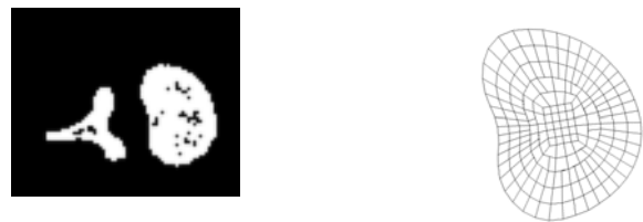
Fig. 2 Reformatted CT scan of endplate and finite element mesh (not to scale)

The geometry for each patient-specific spine model is obtained from pre-operative thoracolumbar CT scans taken in the supine position using a low dose multi-slice imaging protocol. The vertebral column geometry is extracted for the region of interest (ROI) by generating reformatted images through the plane of each endplate in the ROI. Figure 2 shows a reformatted endplate slice and subsequent finite element representation.