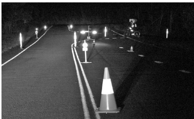
Figure 2. Photograph of the section of the road circuit where Cyclist A was positioned

The direction that the test cyclist faced was also varied between laps to simulate the two most common crash configurations reported by cyclists in our previous paper [10], where 38% reported a crash in which the motorist collided with a cyclist turning across their path when they were both heading in the same direction, and 19% reported being sideswiped. For half of the laps the cyclist faced in the same direction as the driver, and for half the laps the cyclist was positioned side-on to the driver (see Figure 2), as if they were about to enter the traffic from a street at 90 degrees to the driver's direction of travel.