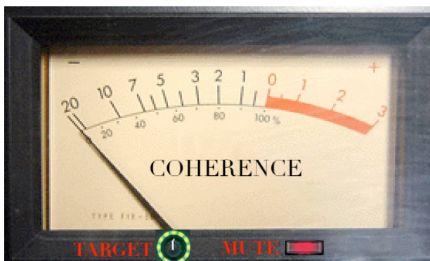
Figure 7. A coherence level metre.

A useful metaphor for the coherence level is a VU metre, that constantly monitors the level of some property of an audio stream in real-time.