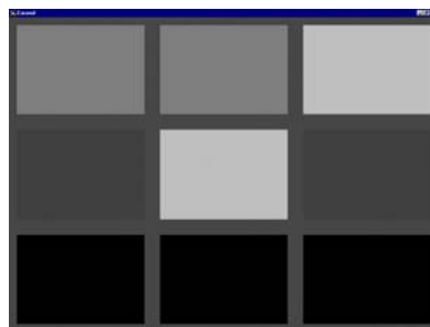
Figure 1 Example luminance experiment stimulus.

A preliminary experiment was performed with 4 subjects situated in a standardised room, with a calibrated monitor [4]. The subject was shown a grid of 9 quadrilaterals for 100 milliseconds, followed by a visual noise mask for one second. The subject was asked to rate the conspicuousness of the centre target (Figure 1) as High or Low by hitting, during the presentation of the noise screen, one of the two shift keys on a computer keyboard. Four sessions of 125 stimuli were shown with local target-surround differences of 0.0, 0.25, 0.50, 0.75 and 1.0, with 0.0 representing no signal (black) and 1.0 representing the highest possible monitor signal (white).