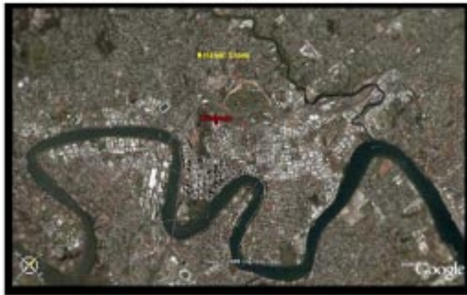
Figure 2.0: Aerial photo of Brisbane showing location of Kelvin Grove.

Kelvin Grove (figure 2.0) is an inner city suburb, situated approximately three kilometres from Brisbane, in which the Kelvin Grove Urban Village is located. The village is built on a sixteen hectare block and is an innovative idea which is the