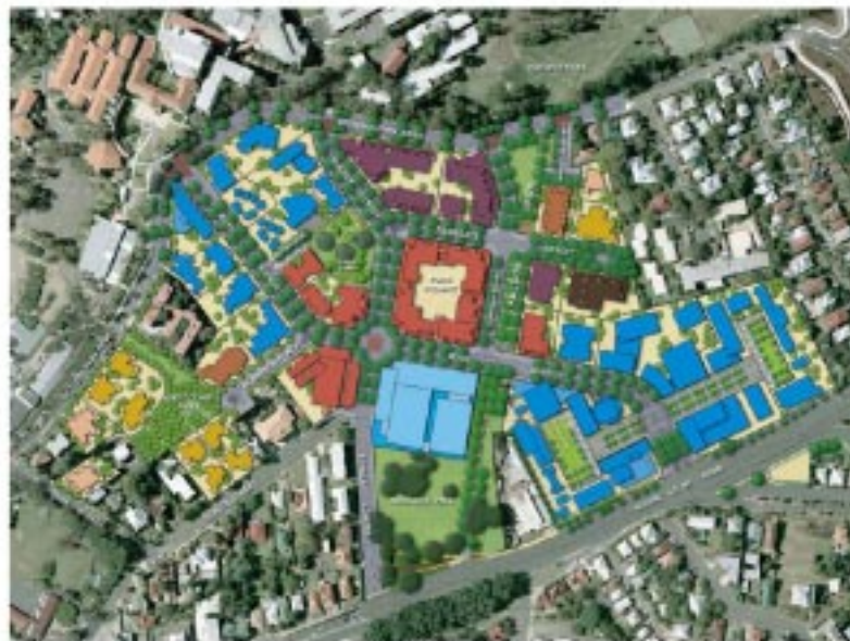
Figure 3.0: Artists impression of the design plan