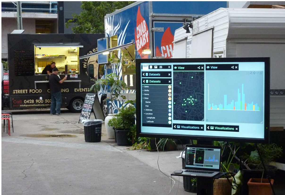
Figure 3: DataChopin at Wandering Cooks.