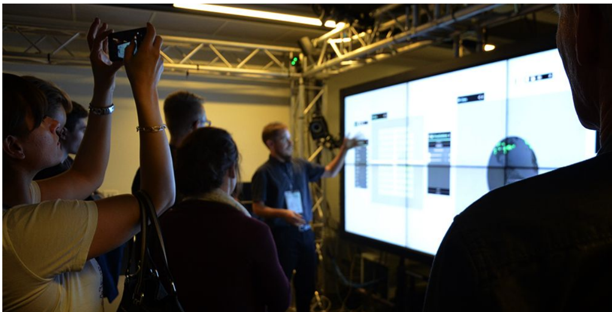
Figure 2: DataChopin at the QUT Viser Lab.

Since early 2016, the research prototype has been continuously tested and exhibited on-demand at the IFE Viser lab, making use of QUT's large-screen visualisation facilities. The evaluation included two workshops, during which groups of participants engaged with the collaborative interface. Through a series of activities, the workshops explored applications of the interface based on real-world academic quality assessment schemes. The interface was used to visually represent bibliometric data in order to discover high-quality research outputs. The ability to rapidly tailor visualisations and take initiative during the investigation was well received. This use case served as an example of collaborative data analysis in academic settings.