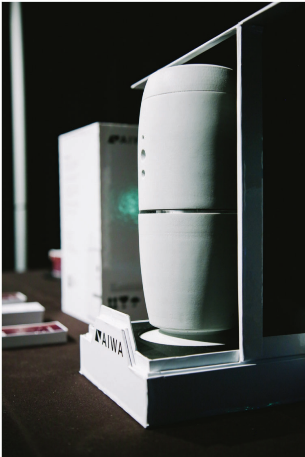
Figure 29. 'AIWA'. AEFA 2018.