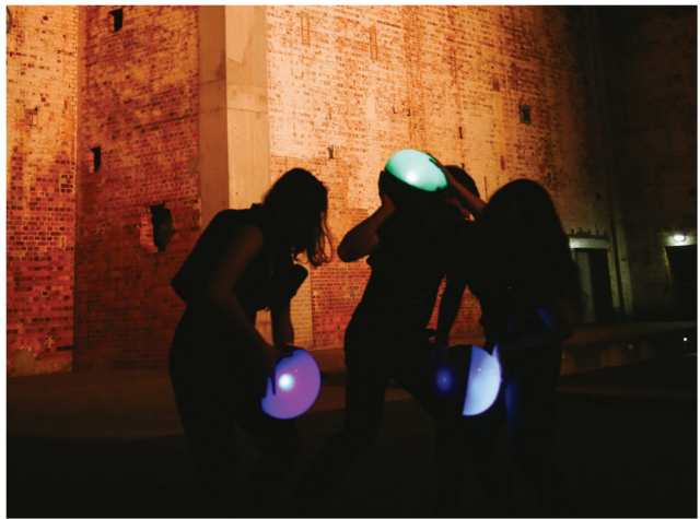
Figure 27. 'Soundline'. AEFA 2018.