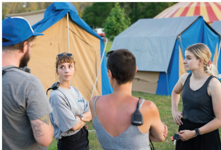
Figure 24. Meeting between management areas. JLF 2018.