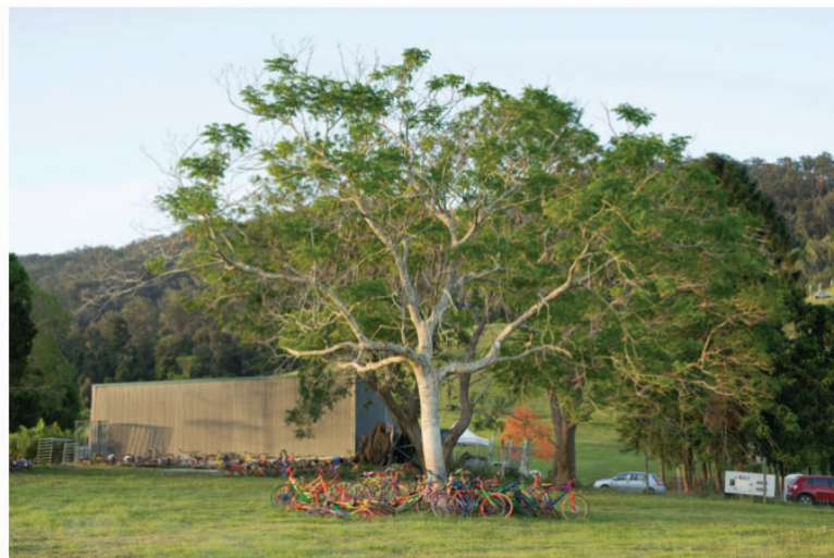
Figure 23. Jungle Love Festival Site. JLF 2018.