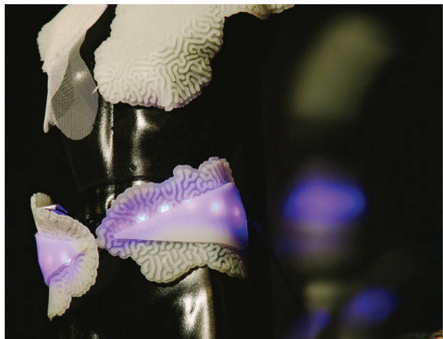
Figure 28. 'Dilate'. AEFA 2018. Courtesy of Cassidy Cloupet.