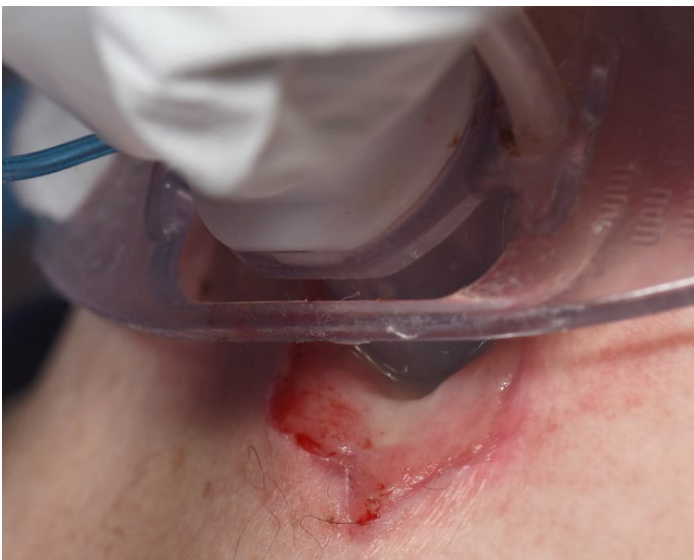
Image 2 Tracheostomy stoma showing V-shaped margin