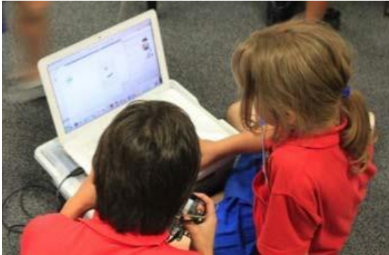
Figure 3.0 Programming Lego Mindstorms Robot

We saw repeated evidence that the children applied new programming language in their verbal interactions with one another. As the children implemented their plan, the function of speech and the application of new vocabulary became connected to the immediate use of the tools (See Figure 3.0 and Transcript 4.0).