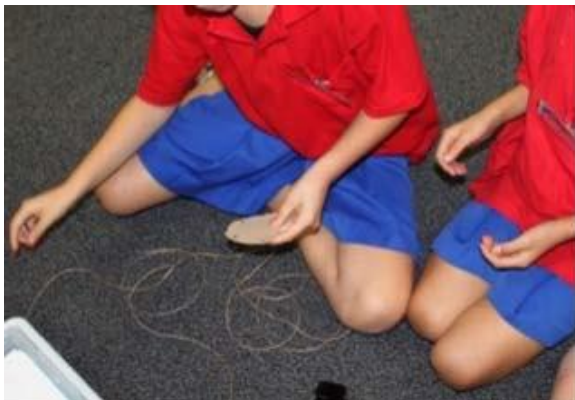
Figure 2.0 Children talking as they make an elevator to lift a Lego character.

We observed that the use of language was central to both the children's ability to create new relations to the learning environment, and the mental organisation of their problem solving behaviour. The following transcript is one of many instances in which we observed how the children's speech shaped their problem solving activity into a structure. Two children are presenting a mock interview about their problem-solving task as a third student digitally records the interaction using a computer webcam (See Figure 2.0 and Transcript 1.0).