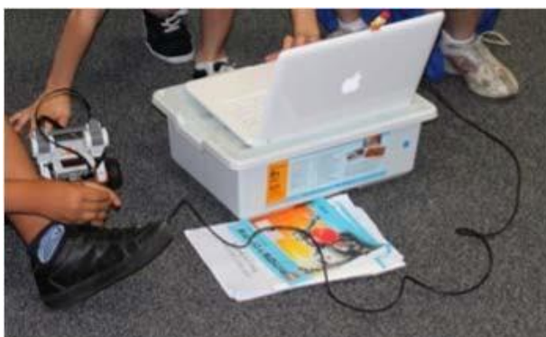
Figure 4.0 Testing the robot

Now we turn to examine the architecture of these co-constructed speech interactions that structured the enactment of the cooperative problem solving process. We observe the specific language formulations that enabled the students to focus, monitor, and control their problem solving behaviour (See Figure 4.0 and Transcript 5.0).