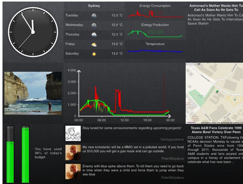
Fig. 3. Main screen showing widgets in ‘view’-mode.